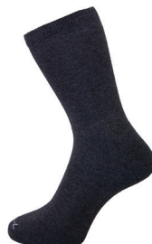
Grey Crew Sock 3pkt