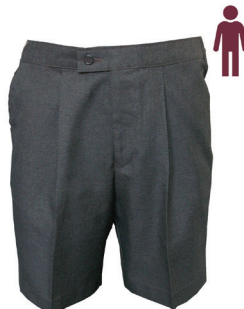
Shorts Senior Pleat Front - Grey Melange