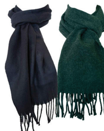
Scarf Navy or Green

For current prices, please refer to www.bobstewart.com.au