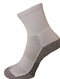
Sports Sock 2 pkt