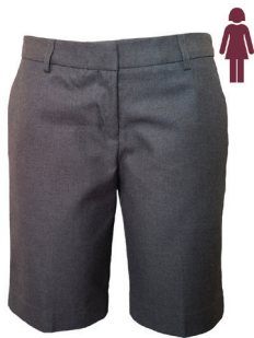
Tailored Shorts - Grey Melange