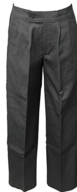
Trouser Doubleknee - Grey Melange